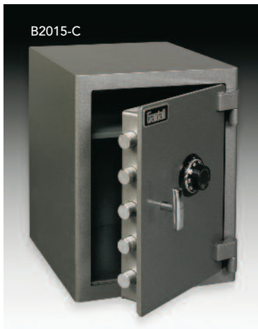
Five massive 1/4" bolts in boltwork