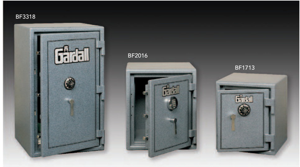
Gardall's BF models provide both burglary and fire protection for your home or office application. We have been manufacturing fire safes since 1950 and the BF safe is our premier model in quality and function.

All BF safes were tested by the manufacturer along side a U.L. listed one-hour fire safe in an independent fire testing facility. The BF safe actually outperformed the U.L. fire safe by 15 minutes. The exterior of the safe was heated to 1700°F for one hour and during that time the interior temperature of the safe was less than 270°F. A letter of certification is available upon request. All BF safes carry Gardall's Lifetime Replacement Guarantee.